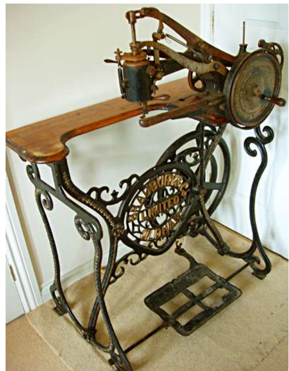
A1 Repairing Machine: The ornate stand is in beautiful condition

looking too bad. The price tag was £120, which was less than I’d seen machines in worse condition sell for. The A 1 Repairing Machine was Bradbury’s Cobbler’s machine and was known as the Shoemakers Friend; as a result these machines had a hard life and are often in poor condition. It was also exported in large numbers to America, which is where most surviving examples seem to turn up, so even though it was made in Great Britain it isn’t particularly common. I gave the machine the once over, remarkably the highly ornate stand was in excellent condition. At first I wasn’t sure if the gold had been repainted as there was so much left but checking closely it became obvious it was all original, the main problem was the pitman was missing but at least the joints were there. Moving onto the table, it may have been refinished and had split in two places then boded back together, but still, that could be fixed. The head itself was slightly worn and the bare steel parts had surface rust but the Hand Wheel had retained most of its decals. The worst part was the metal ring on which the bobbin winder is mounted had fractured, however it’s relatively minor, isn’t structural and is repairable. Lastly someone had added an additional spring between the tension discs and the arm (why??). So yes it needed some work but nothing too serious.