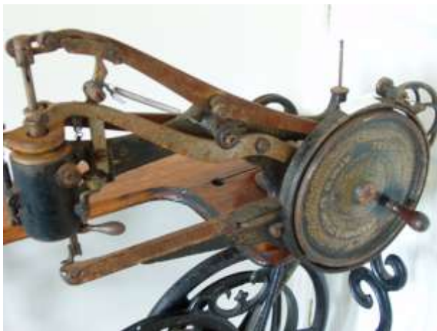
A1 Repairing Machine Head

As I came out of one of the last tents (marquee is too grand a term) I virtually walked into an enormous leather-stitching machine. I did a quick double take to make sure my eyes weren’t deceiving me but no, there was a Bradbury A1 Repairing Machine in all its glory and it wasn’t