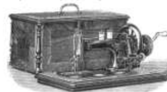
GRITZNER No. 6 A