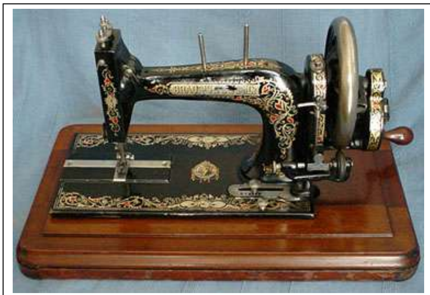
High Arm Family c1905

Unlike many British sewing machine Companies Bradbury endeavoured to keep pace with models being introduced in both America and Germany. A classic example of this is Bradbury's High Arm Family machine introduced in the 1890's and which was a copy of the German machines of this type. It is a fairly mundane machine, true early versions have fine filigree gold decals and there were some minor changes during production. Most notably a thumb screw instead of a catch to hold the machine to its wooden base and the handcrank casting was changed from curved to straight (I told you they were minor changes!) Other than that the decals were changed to a Gold/Red almost Paisley pattern. Infact it's quite a boring machine compared with the Mother of Pearl and fancy decal versions produced by the Germans. Bradbury's couldn't new titles and even be bothered to produce a new manual for this machine instead they used the Family No.1 manual with changed the tension adjustment illustration