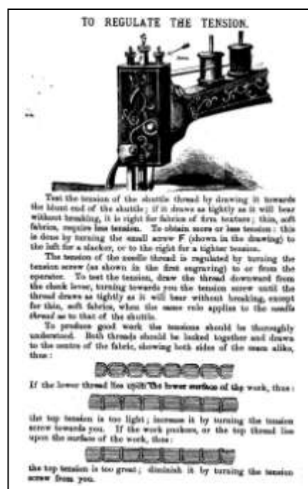
1904 High Arm Family Manual

Even as Bradbury enthusiasts we find it hard to get excited about this model, so why would we add another one to our ever expanding collection? Could it be that it had its original manual (which helps with our research), or perhaps because it's a combination? (That is a Hand & Treadle machine). There again maybe it was because it was just 20 minutes drive away and came free of charge. All those helped but then just take a look at the decals. The WOW factor has it!